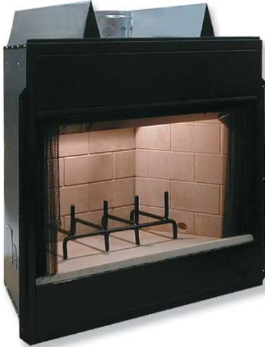
SWB400I Wood burning Fireplace