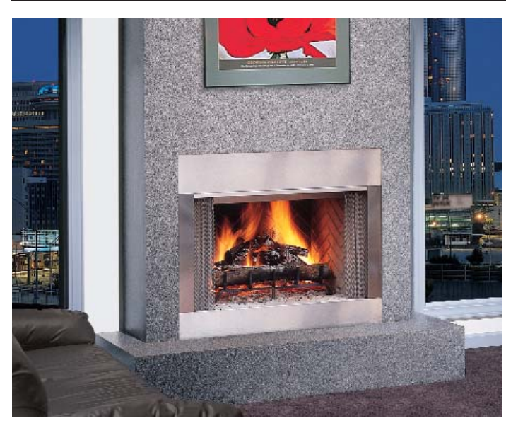
HWB700OD Indoor Fireplace