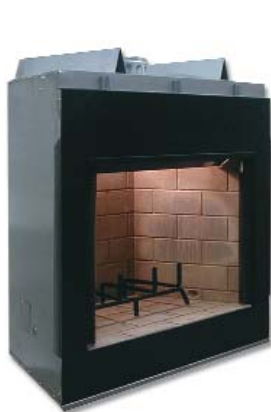
HWB600 Wood Burning Fireplace

* Fireplace should be set in place before framing 58" dimension.