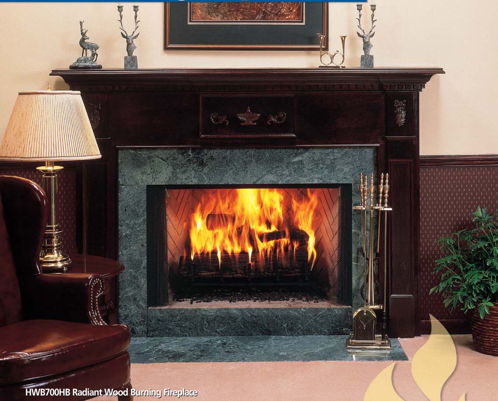
HWB700HB Radiant Wood Burning Fireplace