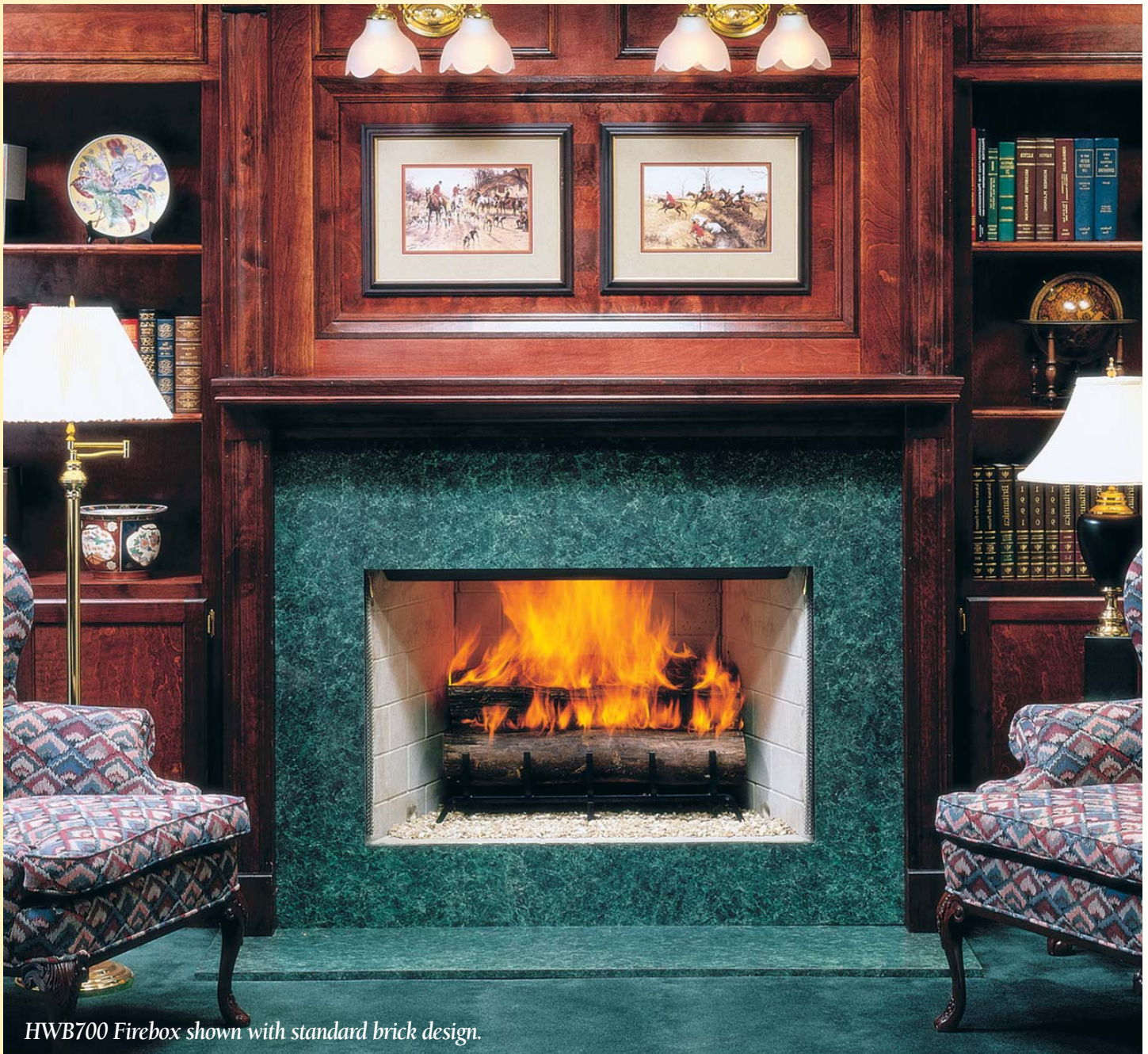
HWB700 Firebox shown with standard brick design.