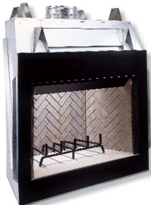
HWB800HB Wood Burning Fireplace