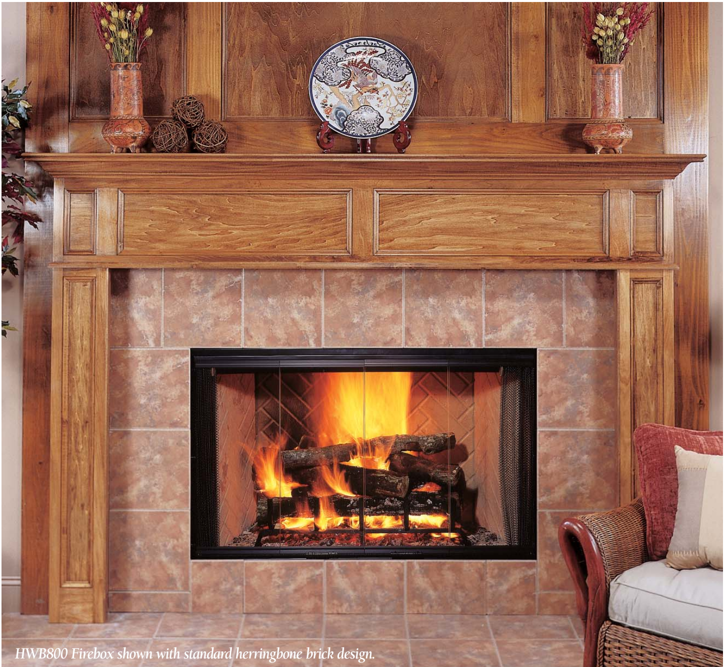
HWB800 Firebox shown with standard herringbone brick design.