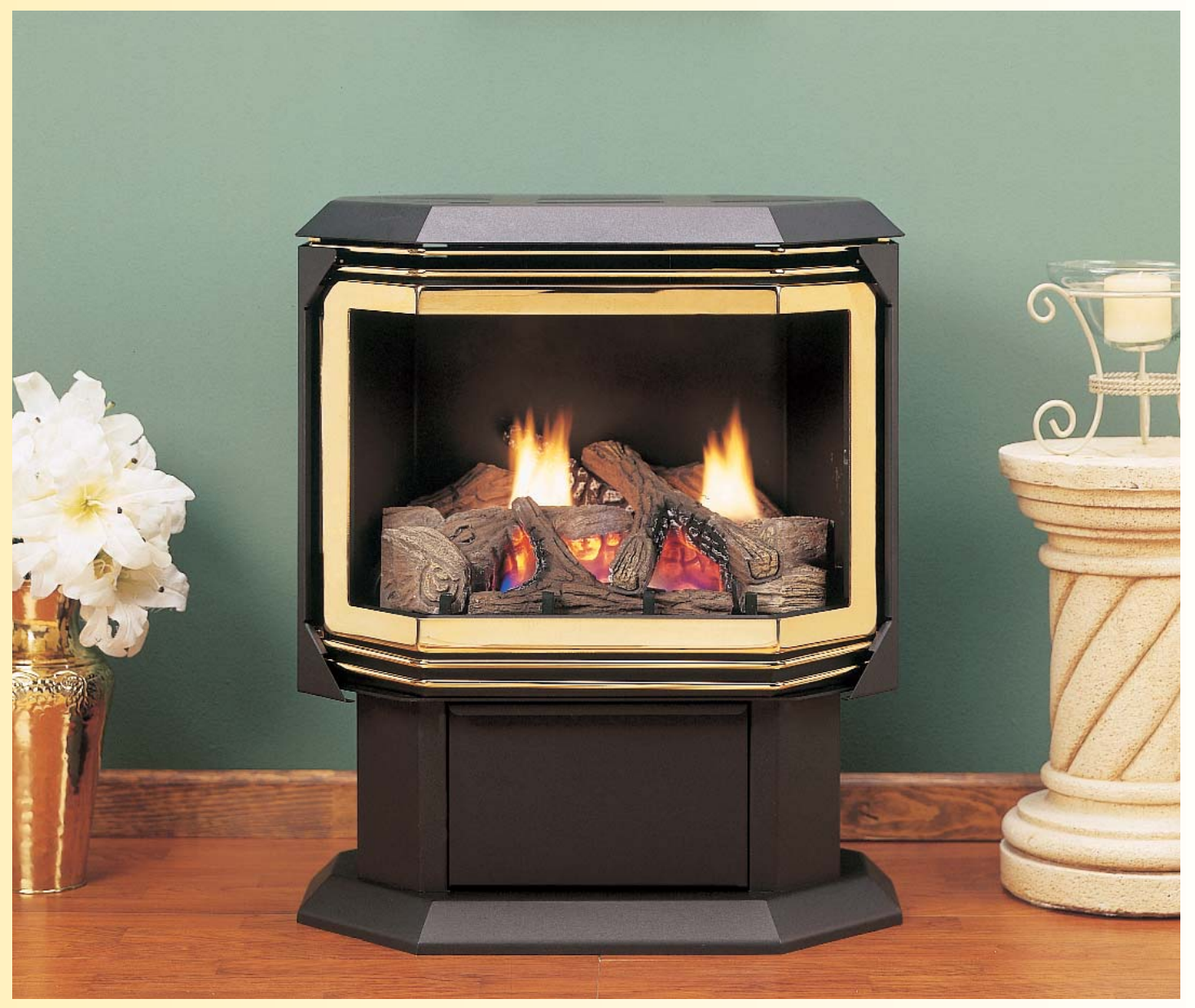
DSS Vent Free Steel Stove shown with optional gold-plated door frame with screen.