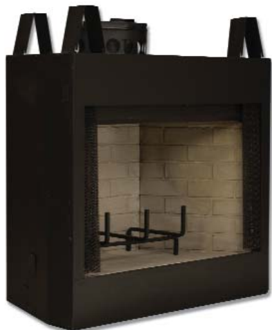
BWB400A Wood burning Fireplace