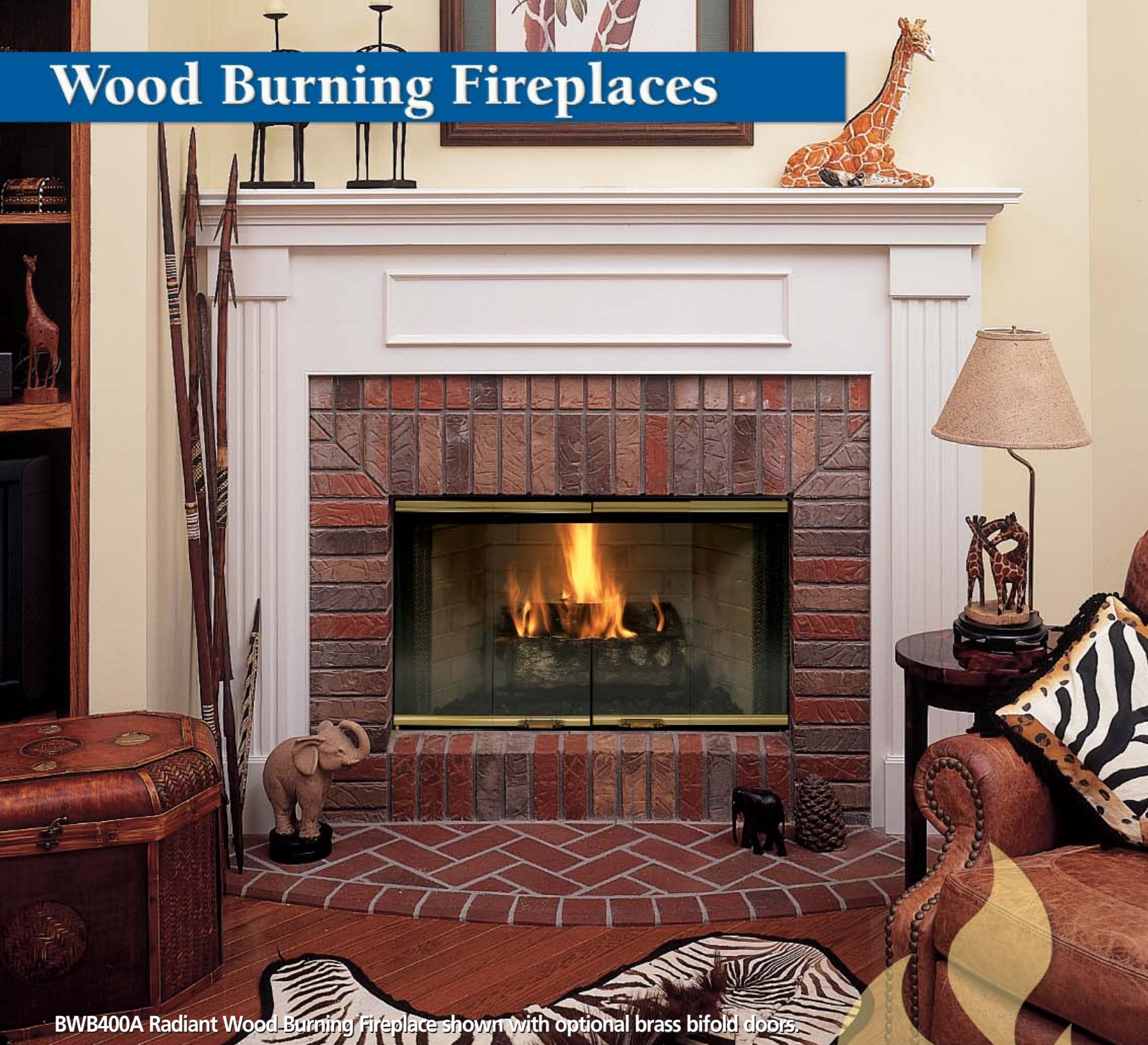
BWB400A Radiant Wood Burning Fireplace shown with optional brass bifold doors.