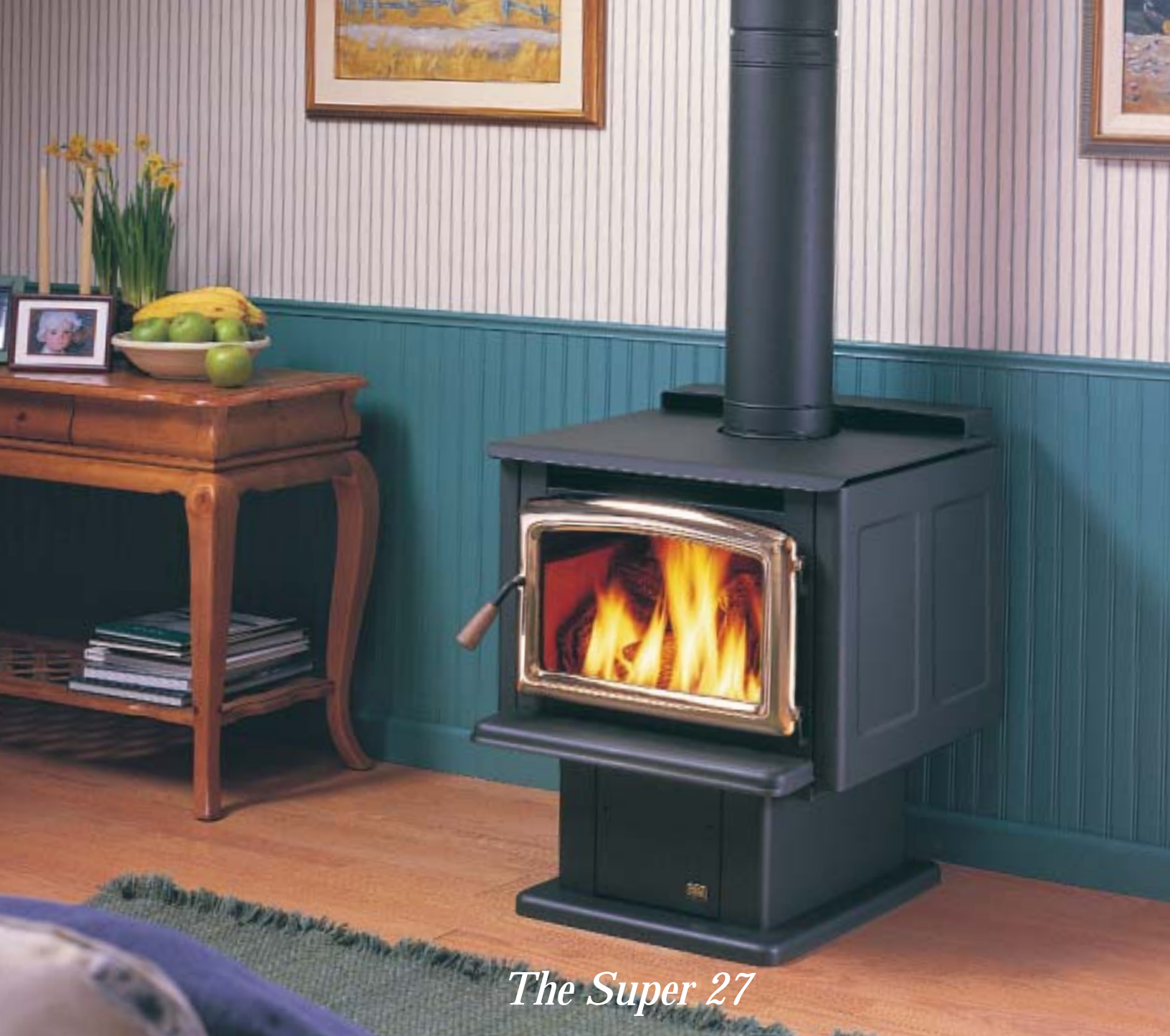
The Super 27